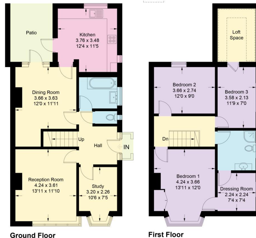
Illustration for identification purposes only, measurements are approximate, not to scale. (ID1288417)