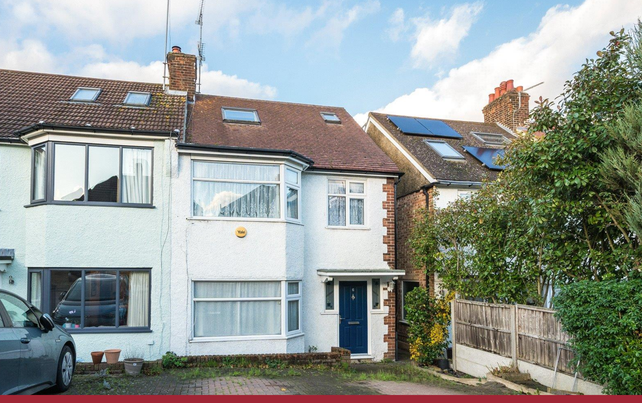
Dalmeny Road, New Barnet, Hertfordshire, EN5