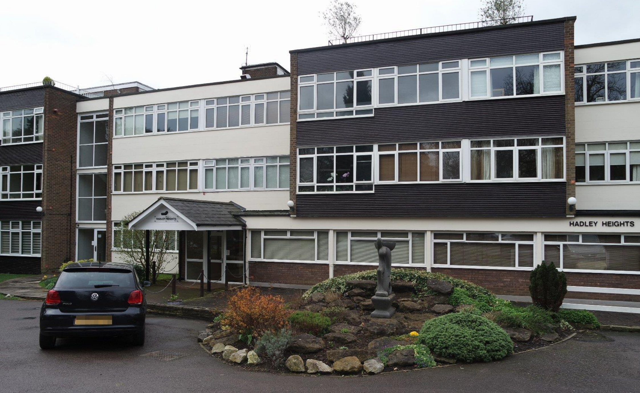
Hadley Heights, Hadley Road, Barnet, Hertfordshire, Offers in excess of: £400,000 EN5