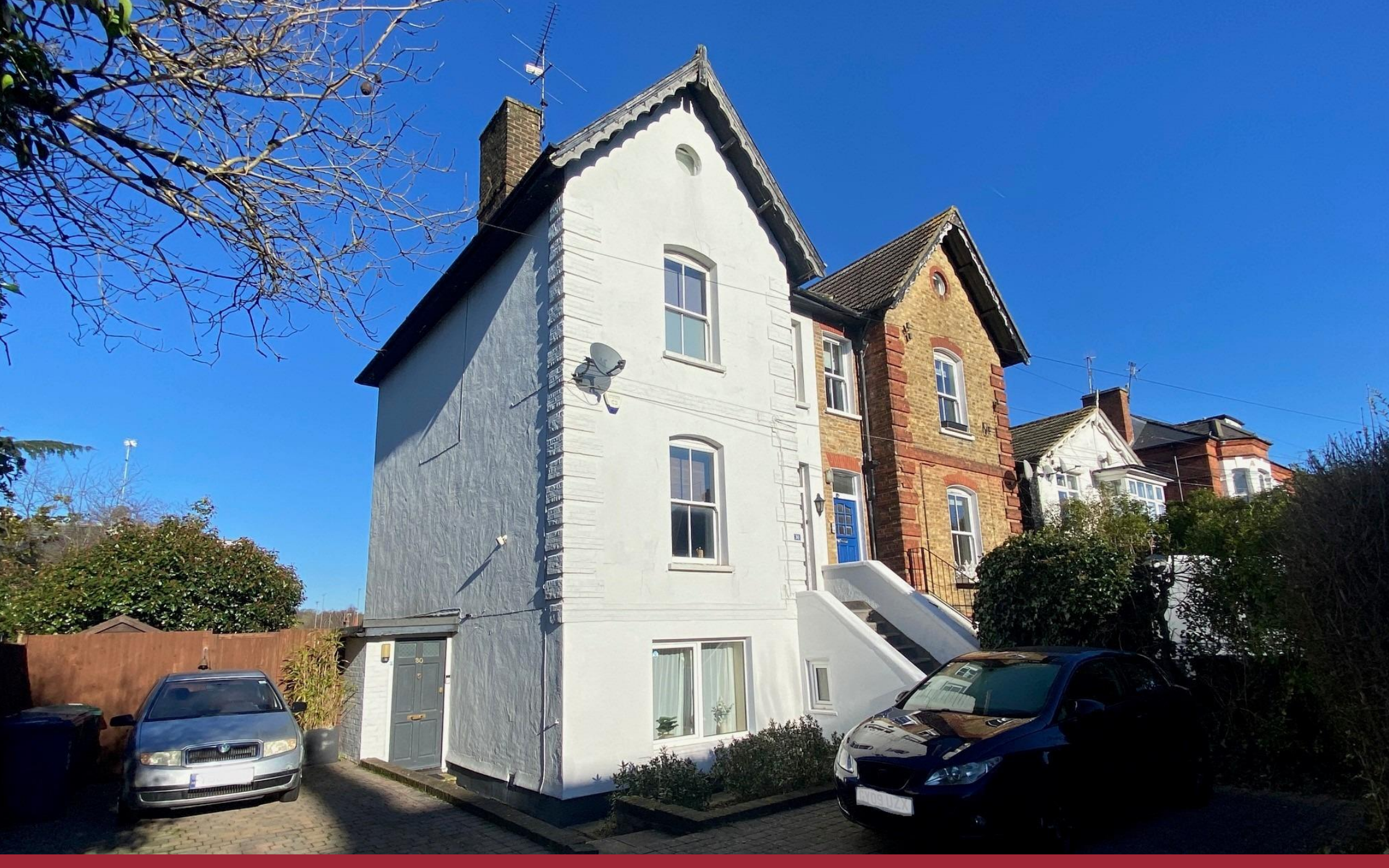
Leicester Road, New Barnet, Hertfordshire, EN5