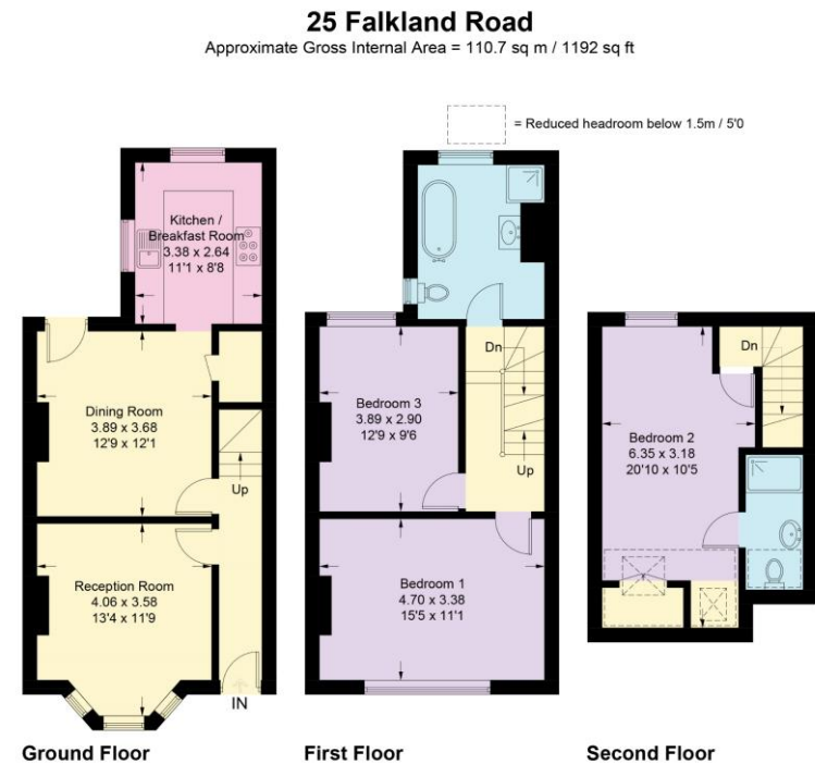
Illustration for identification purposes only, measurements are approximate, not to scale. (ID 969277)