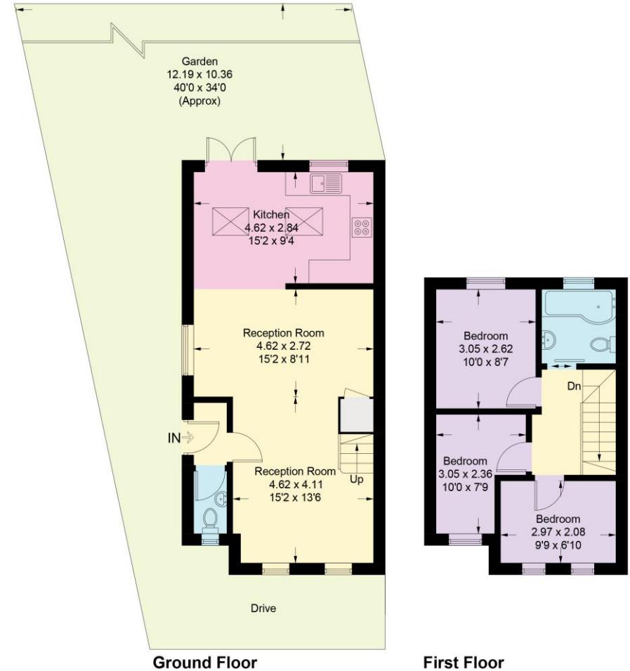
Illustration for identification purposes only, measurements are approximate, not to scale. Fourlabs.co © (ID1134238)

Approximate Gross Internal Area = 76.4 sq m / 822 sq ft