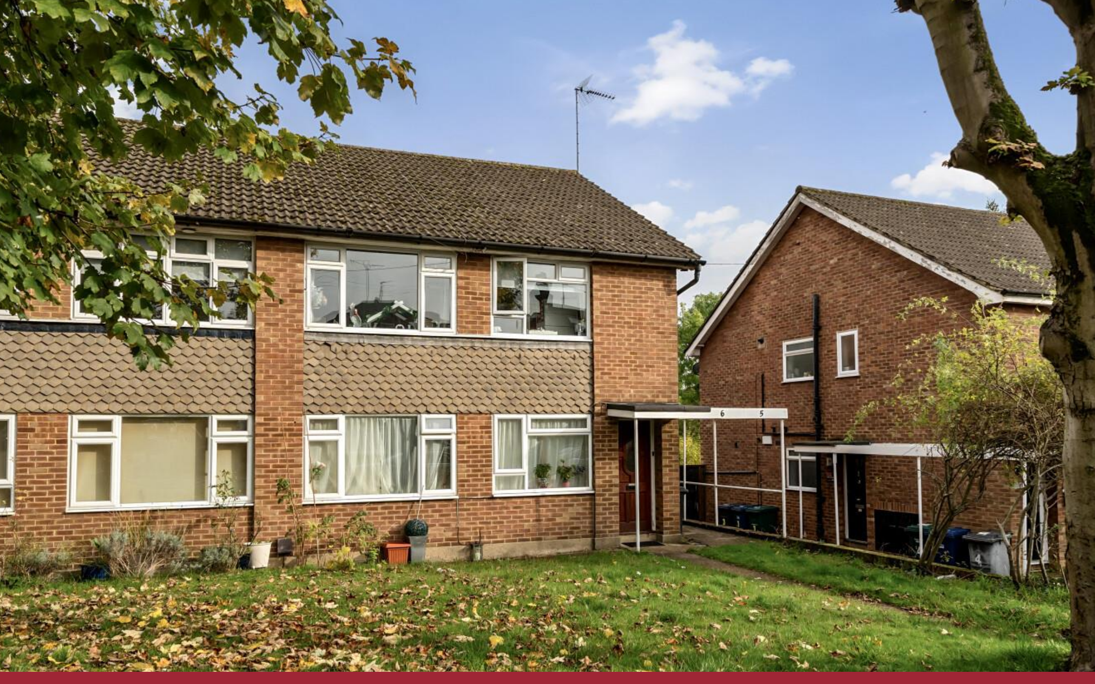
Woodville Road, Barnet, EN5