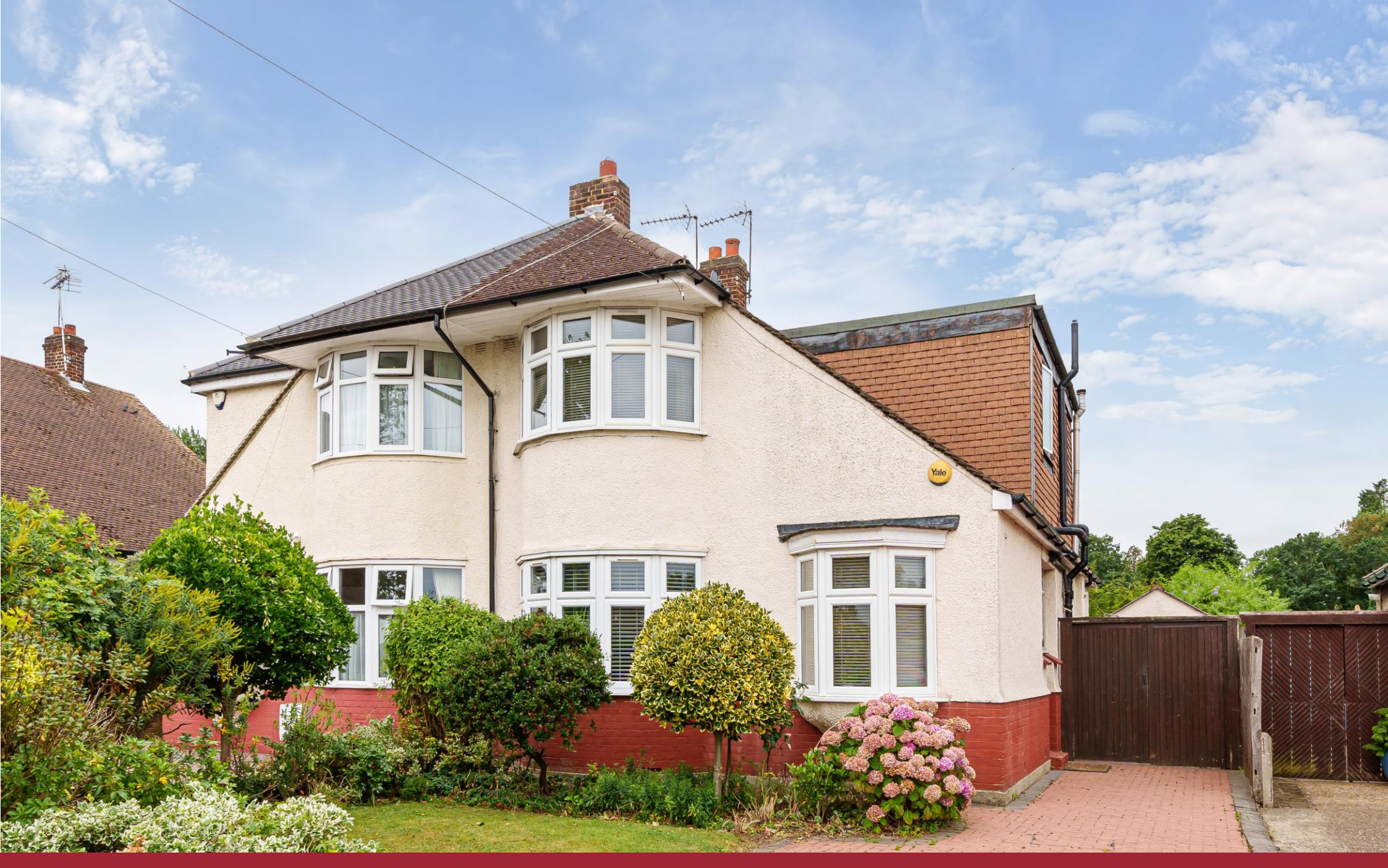
Gallants Farm Road, Barnet, EN4 8ER