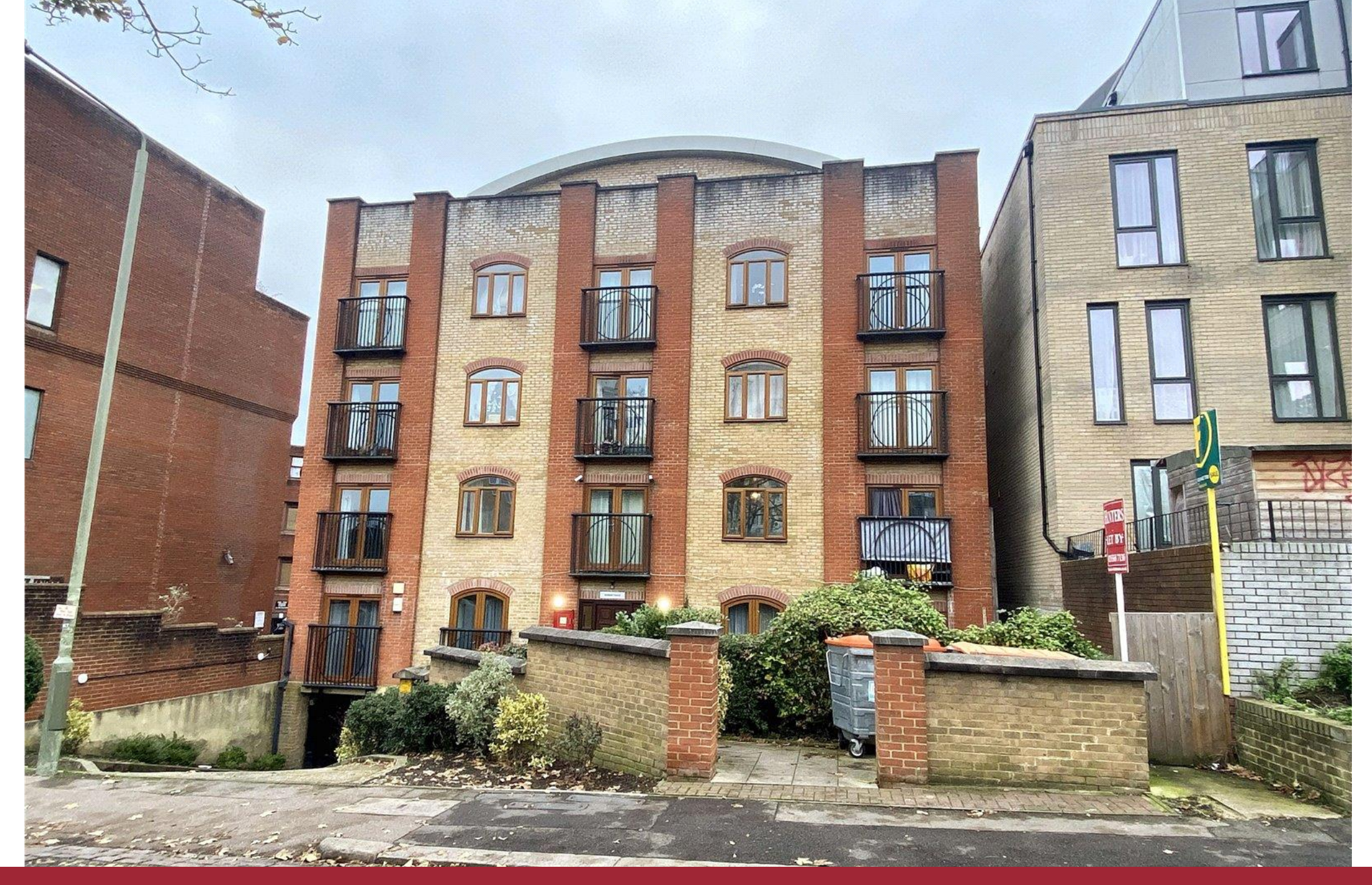
Approach Road, Barnet, EN4