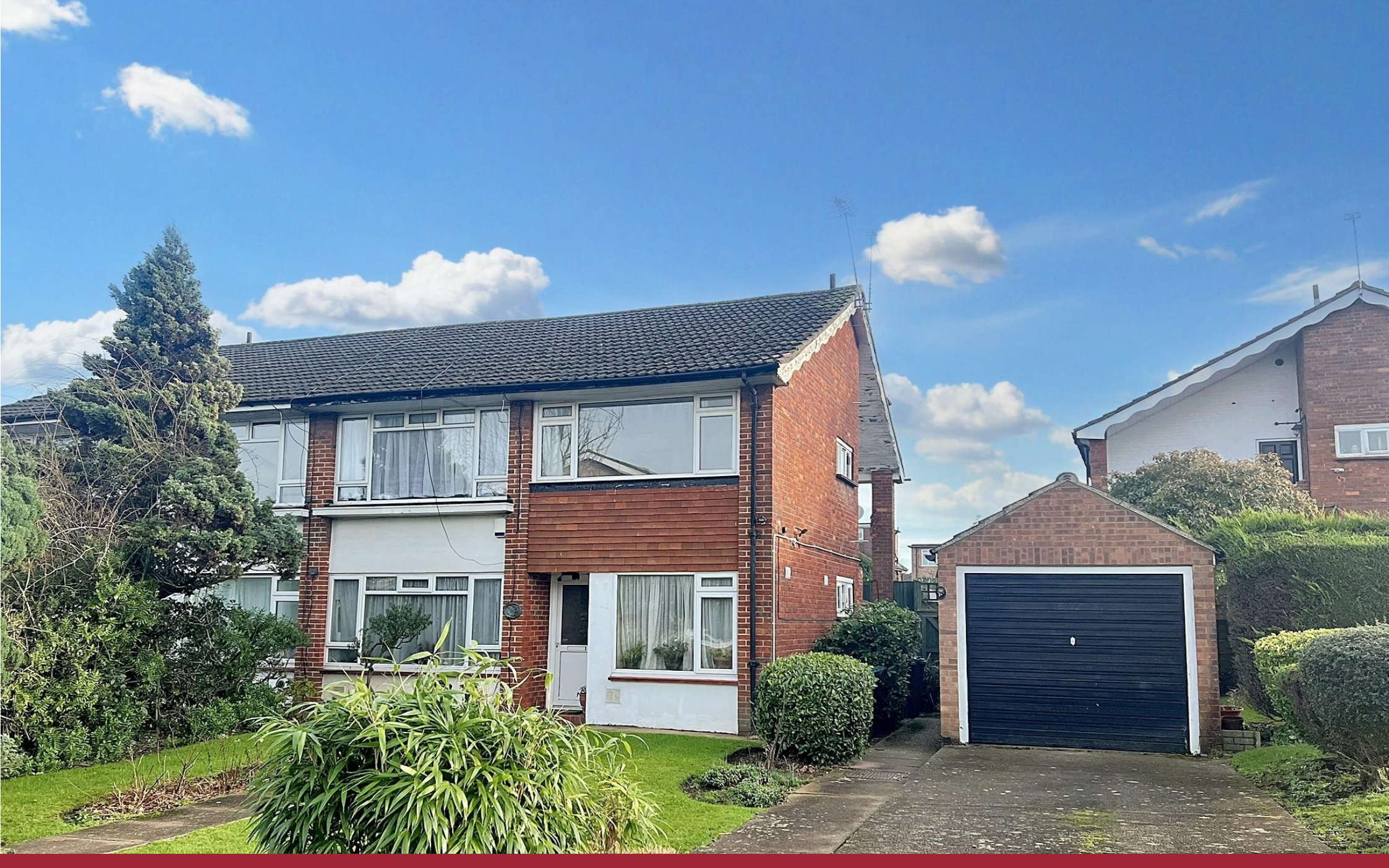
Friern Mount Drive, London, N20 9DP

Asking Price: £450,000 Share of Freehold