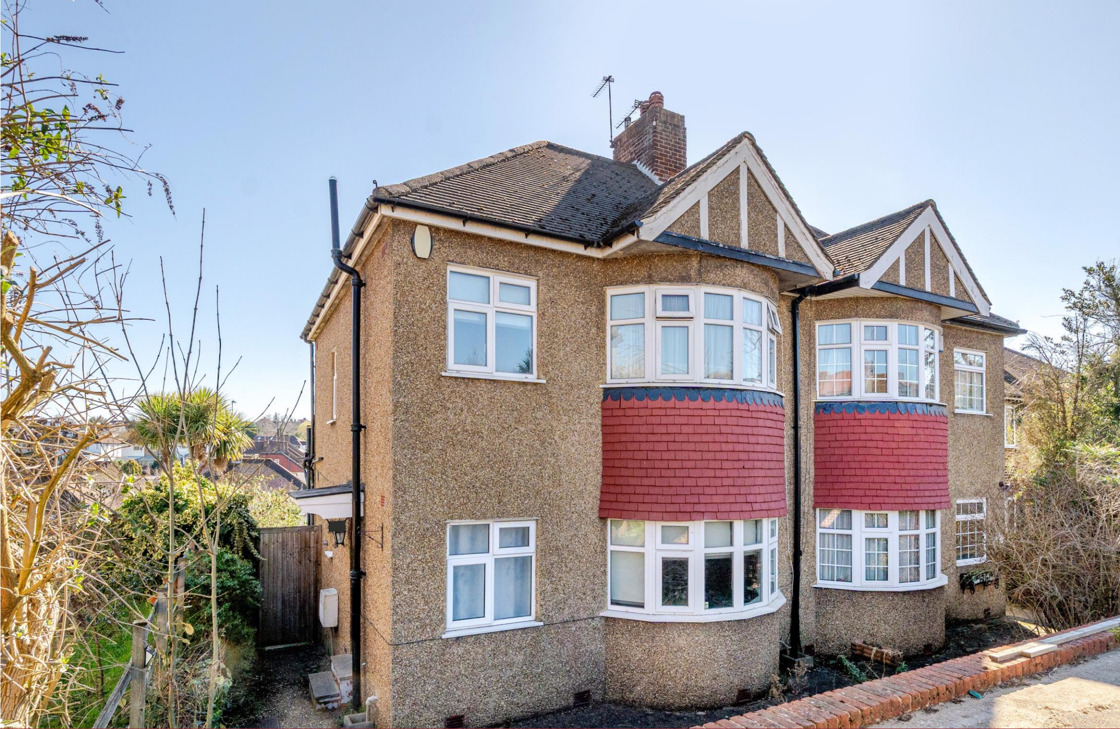
Grange Avenue, Barnet, EN4 8NJ Asking Price: £650,000 Freehold