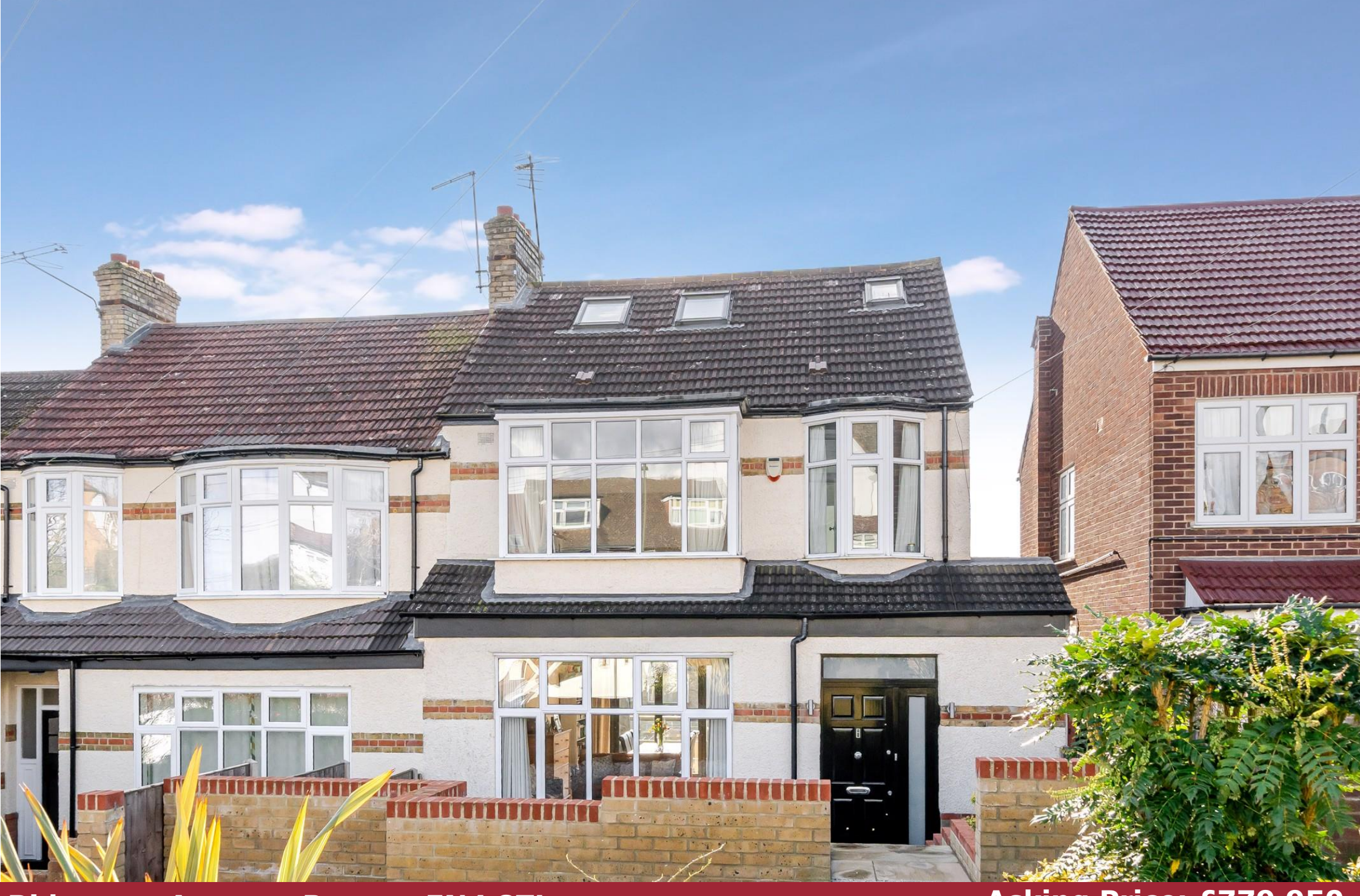
Ridgeway Avenue, Barnet, EN4 8TL