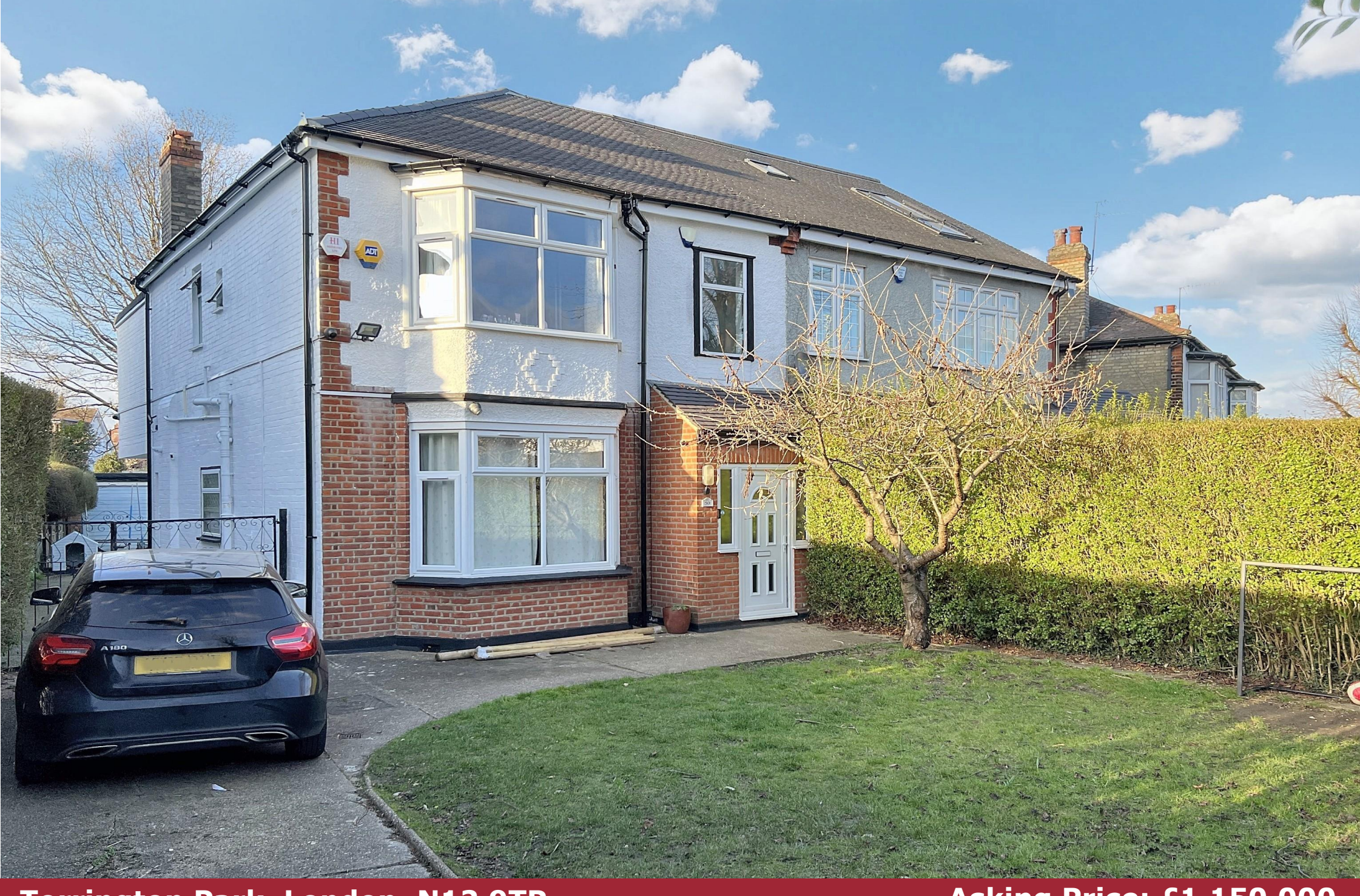
Torrington Park, London, N12 9TP