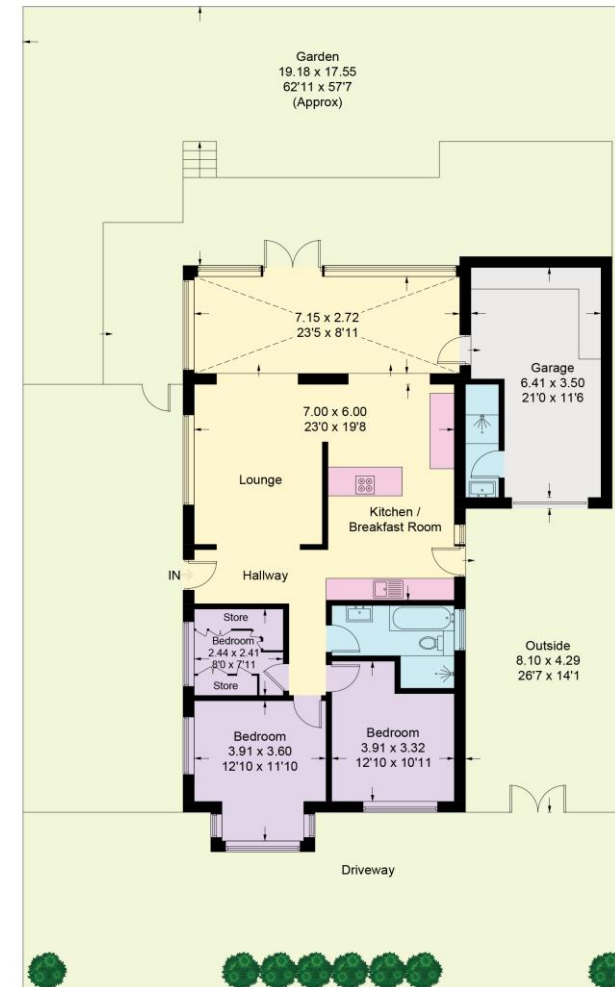
Illustration for identification purposes only, measurements are approximate, not to scale. (ID1314826)